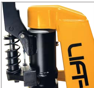
Rugged, robust pump for high reliability.