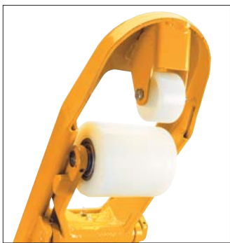
Bushings, grease bushings and ground axes for high performance in the long term.