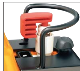
Emergency stop key.

The vehicle halts immediately when the tow-bar is released, or lowered below a designated level. It is outfitted with a protective device that automatically halts the vehicle if the operator is trapped in a tight space. The starting key can be pressed downwards to activate an emergency brake.